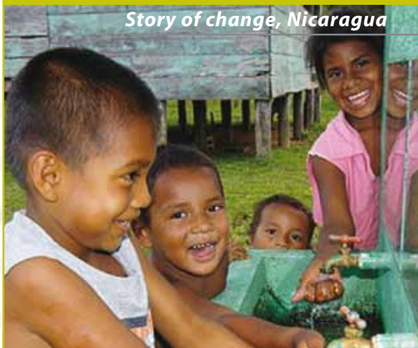
Story of change, Nicaragua

Good governance is an influential factor in achieving the MDGs. Our 11 programmes in this area have strengthened the capacity of national institutions to design and implement water policies and regulations and to provide communities with efficient water and sanitation services. We have also tackled the barriers that indigenous populations and women face in accessing water and sanitation services. Encouraging investment in services to poor communities, we have contributed to the development of new and innovative mechanisms to finance water supply and sanitation infrastructures and services to the most marginalized populations.