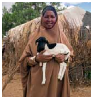
Photo: Edwina Stevens/ Small World Stories/ Ethiopia Delivering as One