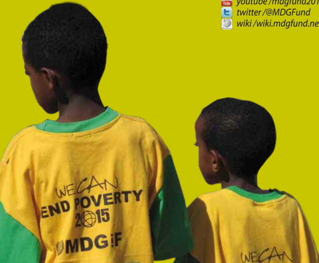
Photo: Great Ethiopian Run. The MDG Achievement Fund partnered with the Great Ethiopian Run, the biggest road race in Africa, to galvanize support towards MDG attainment.