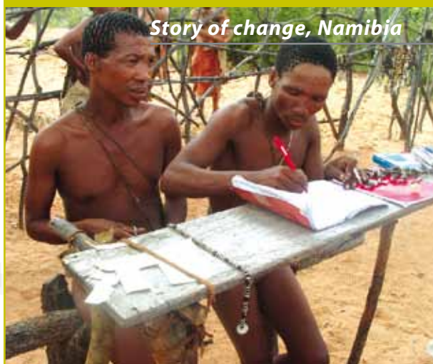
Story of change, Namibia

Respect for cultural diversity promotes vibrant and inclusive societies. We have supported efforts to promote the inclusion of minorities in social, political and cultural life and harness the potential of the creative sector for job creation, economic growth and poverty reduction. Strengthening creative industries and protecting natural and cultural heritage have proved to be effective instruments of economic development. We have worked with indigenous communities to safeguard their cultural heritage and to build health and education services that respond to their worldviews.