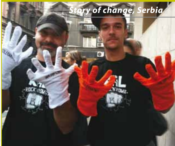
Story of change, Serbia

Violent conflict is often a symptom of social exclusion. These 17 programmes have worked on solutions to overcome conflicts by promoting access to justice, providing peaceful dispute resolution and legal mechanisms, forging intercultural dialogue and building a culture of peace. Innovative and integral approaches to citizen security have reduced crime rates. Sports, arts and culture have been used to channel youth energy towards the construction of positive relations.