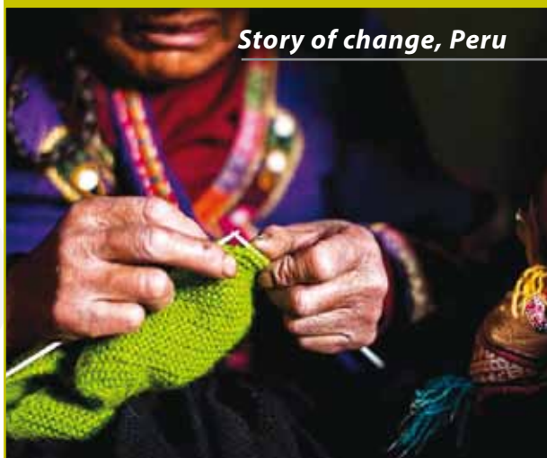
Story of change, Peru

Programmes supported the development of pro-poor growth policies that increase the participation and benefits of the poor in private sector development. Interventions sought to bolster economic sectors where the poor are strongly represented, opening markets to improve opportunities and stimulate small and medium enterprises.