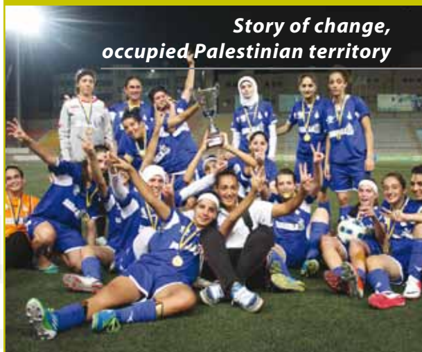
Story of change, occupied Palestinian territory

Progress on the status and role of women over the past decades has been slow and uneven. The MDG-F has supported programmes that bolster women's representation in formal decision-making structures, using disaggregated data to push for gender responsive planning and policy development. Ending the epidemic of gender-based violence was a common thread in most programmes, which focused on strengthening women's capabilities (as measured by health and education), improving their access to resources and opportunities, and reducing their vulnerability to violence and conflict. In addition, a dual strategy approach resulted in the inclusion of a gender perspective across our other thematic windows.